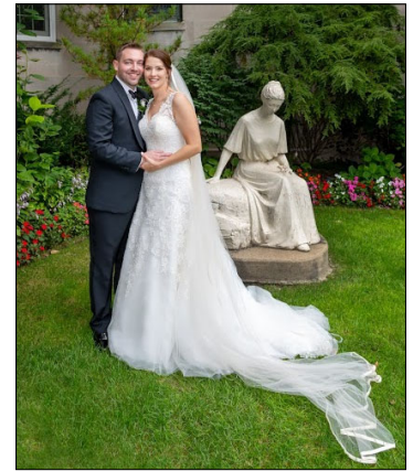
September 21, 2019