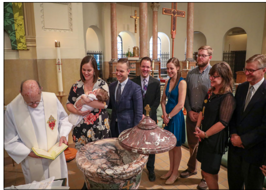
October 6, 2019