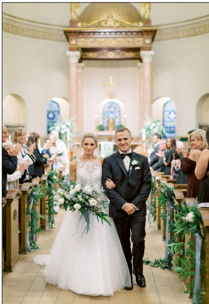
September 28, 2019

* Services/Sacraments scheduled to take place before June 30, 2020, but postponed due to COVID-19. Most were celebrated since July 1, some have been rescheduled for next year.